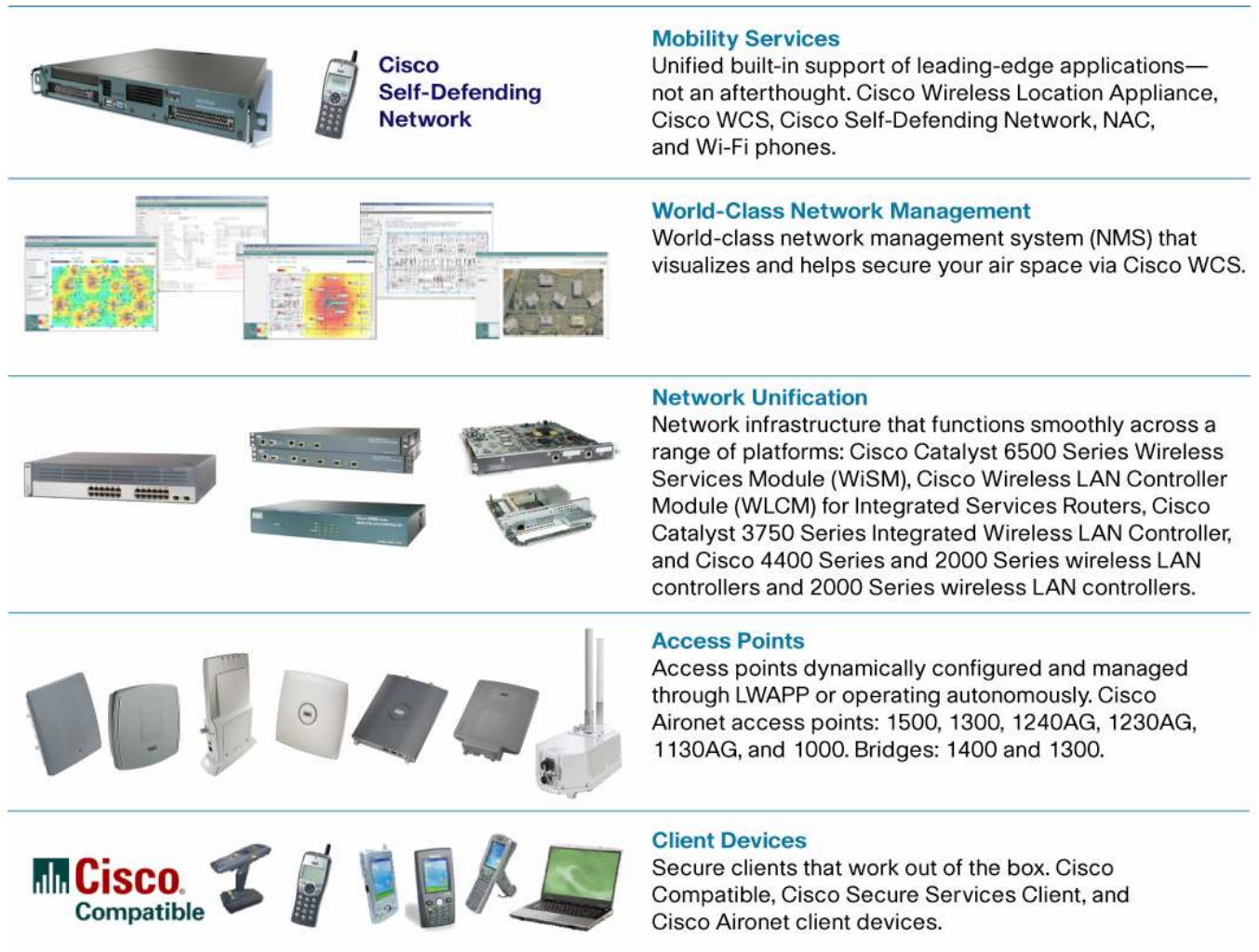
Figure 2. Cisco Unified Wireless Network Product Portfolio

The Cisco Unified Wireless Network is an industry-leading, comprehensive solution that encompasses client devices, access points, controllers, switches and routers, world-class management, and mobility services with enterprise-class support. It provides solid investment protection via a robust product portfolio, unified architecture, smooth migration path to future enhancements, and extensive technology migration programs. It supports real-time business-critical applications and creates a secure, mobile, interactive workplace for organizations deploying WLANs.